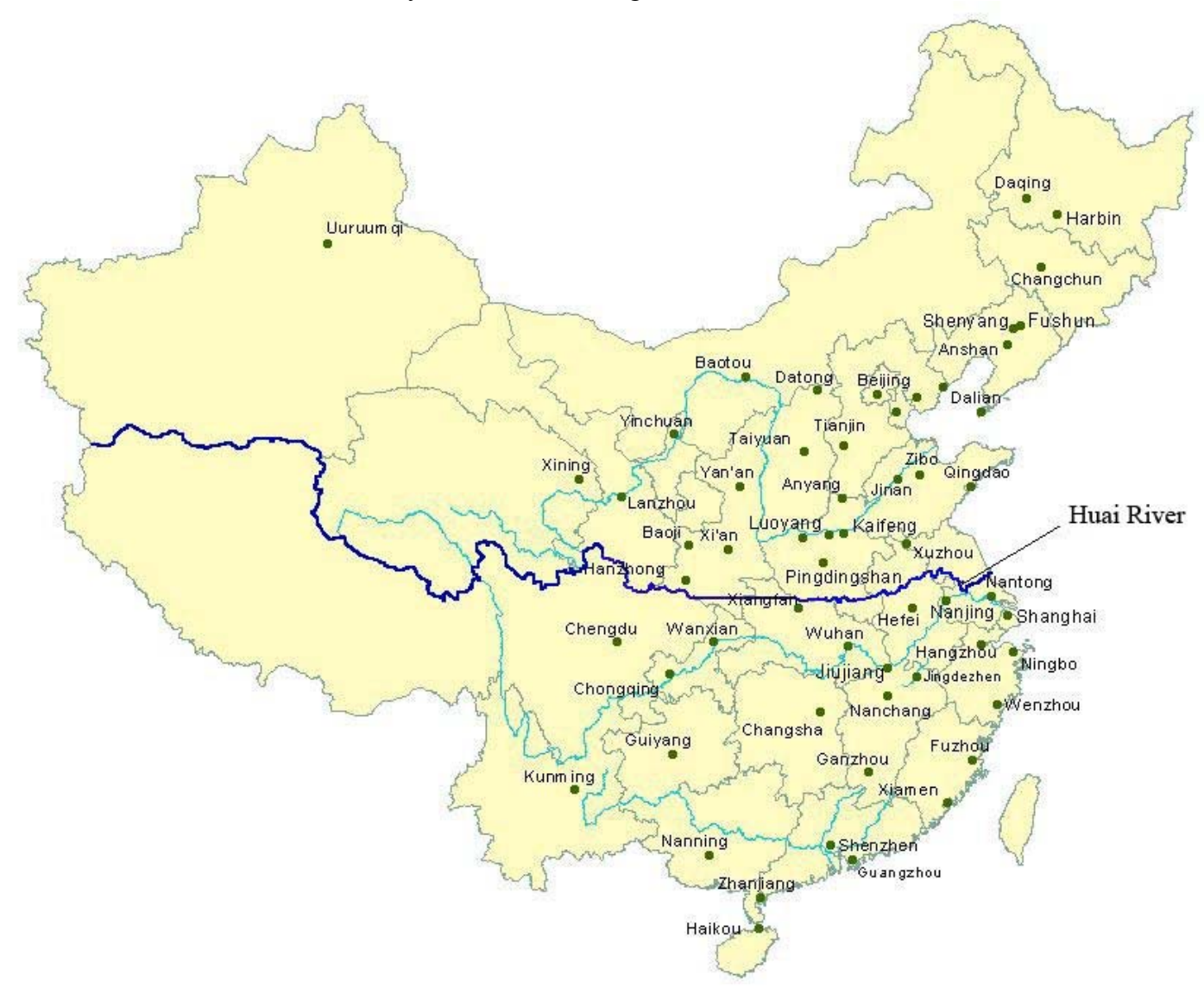
Figure 1: North and South China Denoted by Huai River/Qinling Mountains 0° Celsius Line